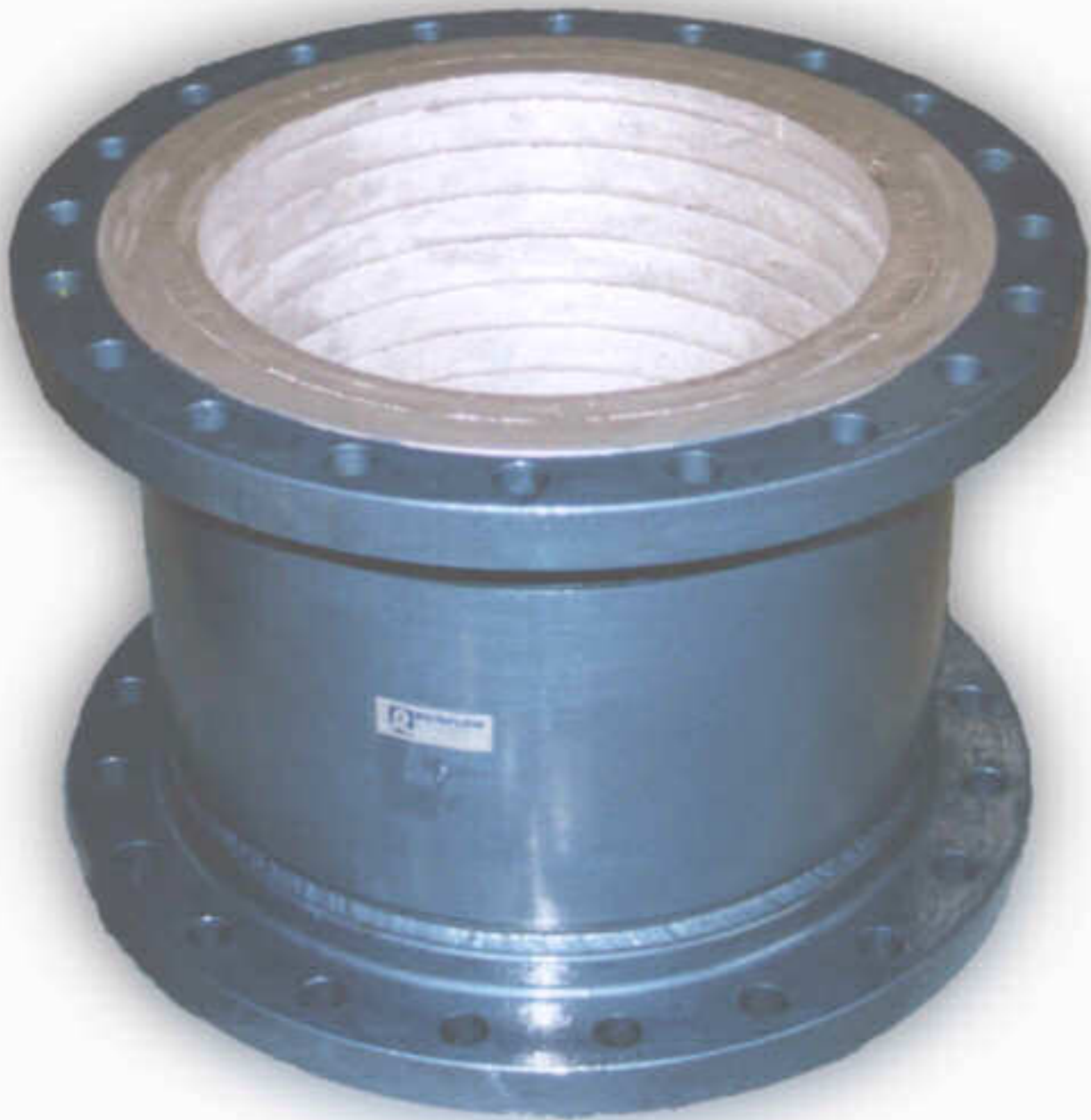
20" Swivel - Chromium Clad Plate Lined, for very abrasive fluids.